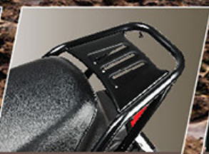
HEAVY LOAD CAPABILITY