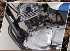
STRONG 150 cc ENGINE